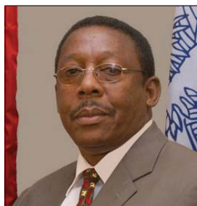
Mayor Bronco Bostick

9:00AM – CHILDREN AGES 3-10; 10:00AM – AGE 11+/ADULTS CITY HALL, RECREATION COMPLEX, 205 E. MAIN STREET